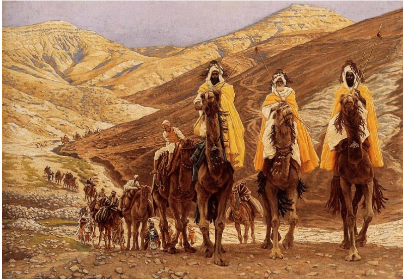
"The Journey of the Magi" (1894) by James Jacques Joseph Tissot

Traditionally, after this weekend, down come the Christmas decorations, out with the tree, and maybe we store away the really beautiful cards. The Magi, at last have arrived, and liturgically it's over. But our imaginations love their story, maybe because some need within us is assuaged with the image of people from all the world coming after a perilous journey to the stable to worship the Child. We return to our beginning, and the beginning of our story.