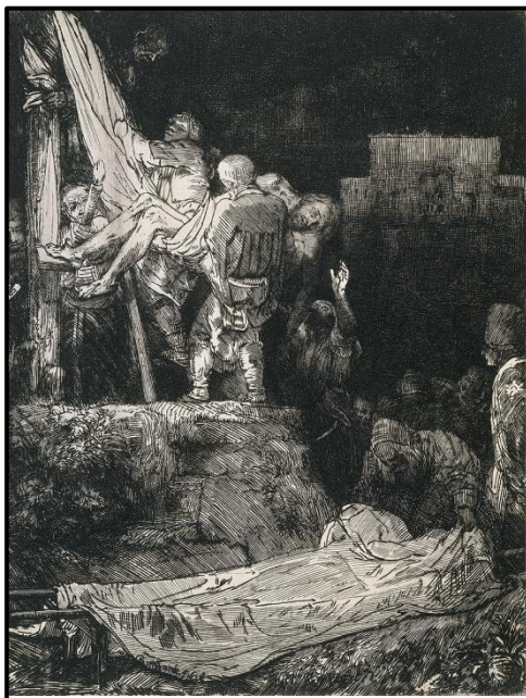
The Descent from the Cross: By Torchlight 1654 REMBRANDT Harmensz.van Rijn

Imagine the sounds (and silences) of Holy Week. Human voices talking quietly, the trickle of water being poured over feet into a bowl, the snap of a breaking loaf of bread, a small group singing psalms anxiously, then walking as quietly as possible outside and up a hill, into a garden, three men in sleep breathing, and Jesus enduring the silence of God. The noise of soldiers coming close, of a skirmish, cries, men running away. Whispers, some in fear, more in conspiracy; an intense and hasty meeting behind closed doors, shouts; a fire crackling, raised voices, an adamant voice, a cock's crow.